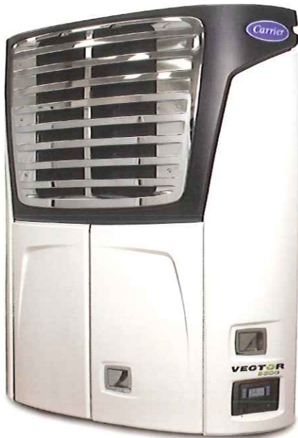
Model 8500 shown with chrome grille/stainless latch option.